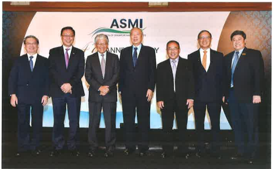
ASMI Presidents (past and present) at the Association's 47 th Anniversary Dinner.

The ASMI Presidents joined ASMI Council members and Guest-of-Honour, Mrs Josephine Teo, Senior Minister of State, Prime Minister's Office, Ministry of Transport and Ministry of Foreign Affairs, for an anniversary toast in celebration of ASMI's 47 years of establishment.