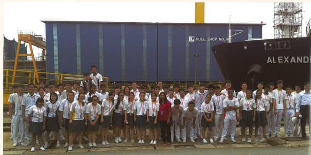
ASMI shipyard members supported the Maritime Open House by hosting the students' visit at their facilities.