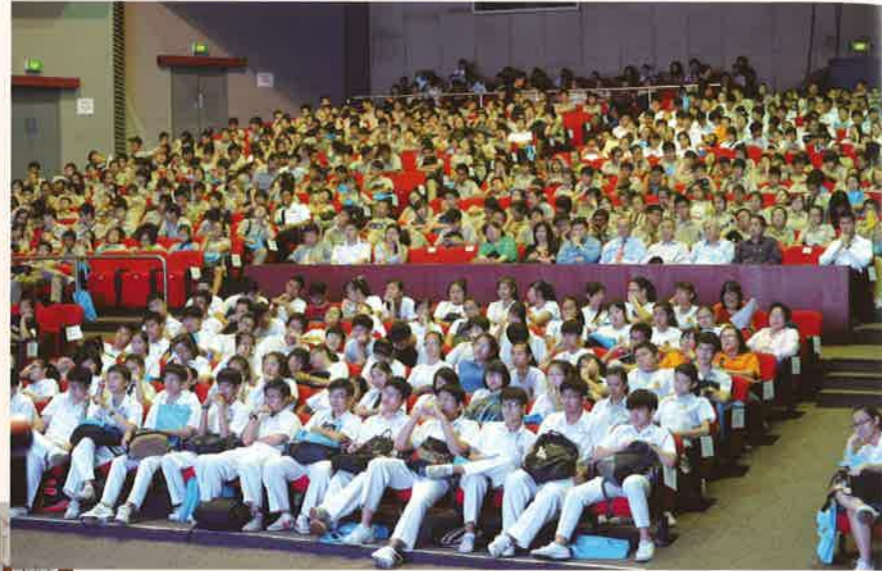
The inaugural Maritime Open House was attended by some 1,150 students from seven secondary schools.

The Maritime Open House was aimed at raising students' awareness in the maritime industry and to interest them to embark on a maritime education and career. A total of 1,150 students from seven secondary schools participated in this inaugural event held at the Kallang Theatre.