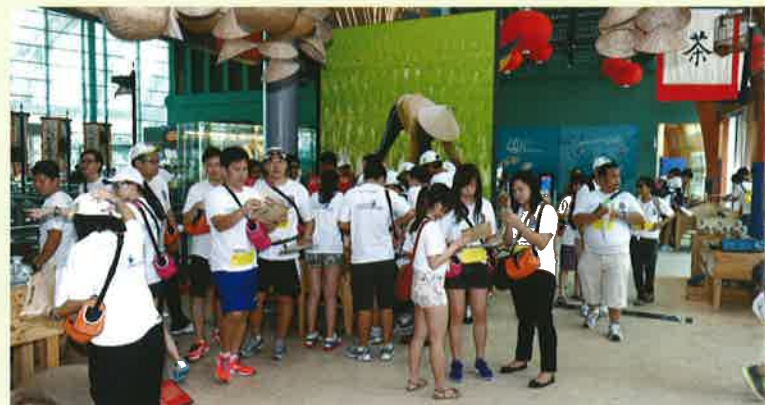
Participants at the Amazing Maritime Challenge, figuring out the clues to one of the nine maritime-themed game stations.

was also held at VivoCity from 17 to 22 April. The exhibition showcased different facets of Maritime Singapore such as bunkering, port, shipping and careers. The exhibition attracted more than 18,000 visitors with its colourful murals, display of container designs, and interactive panels illustrating various facets of Maritime Singapore.