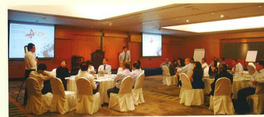
Marine Industries' CEO Roundtable Dialogue in progress.

The half-day session discussed the marine industry's WSH performance and trends. It also facilitated discussions on the industry's roadmap to achieve 'Vision Zero' in WSH. This 'Vision Zero' seeks to inculcate a shared belief that zero injury in the workplace is achievable.