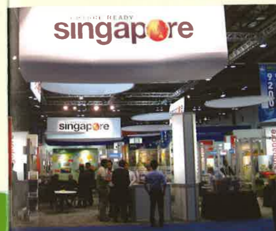
The Singapore Pavilion is strategically located at the entrance to the hall in Reliant Arena.

Given the large scale of the show, OTC was a good exposure opportunity for Singapore companies to showcase their range of capabilities, competencies and technologies to the international players in the offshore oil and gas markets.