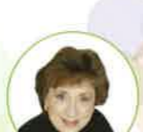
Prof Dame Carol BLACK Expert Adviser, Health and Work Department of Health United Kingdom