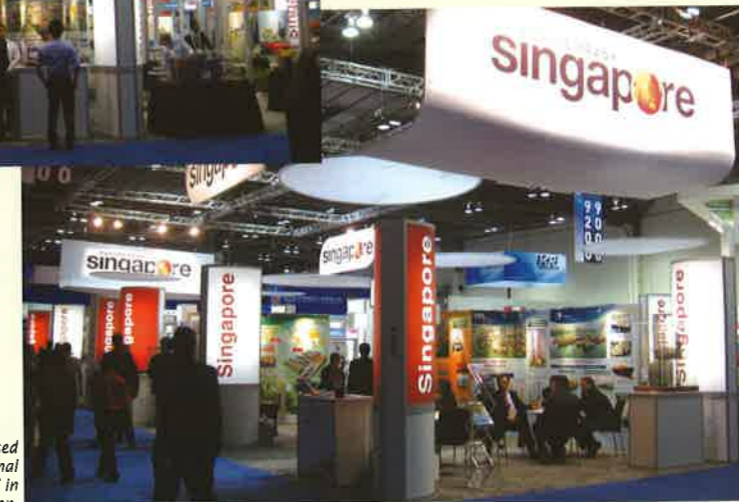
ASMI organised the national pavilion at OTC in Houston.