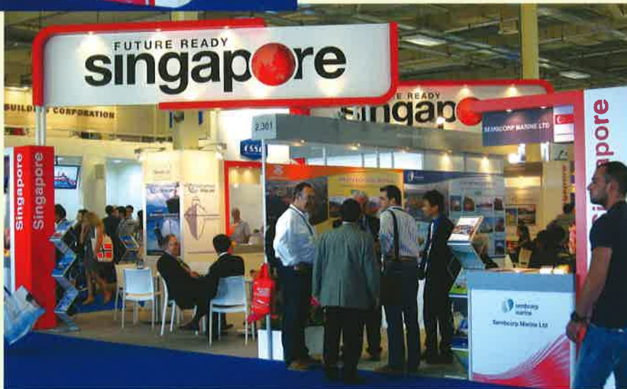
Singapore Pavilion at Posidonia 2012.