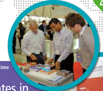
Asia Pacific Maritime